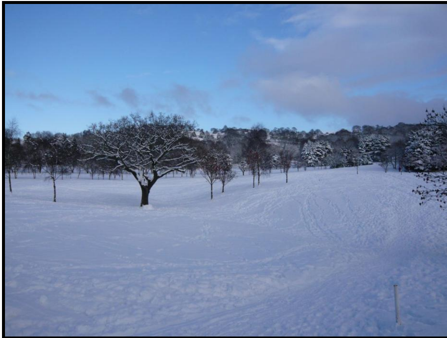
looking down the tenth from the half way house